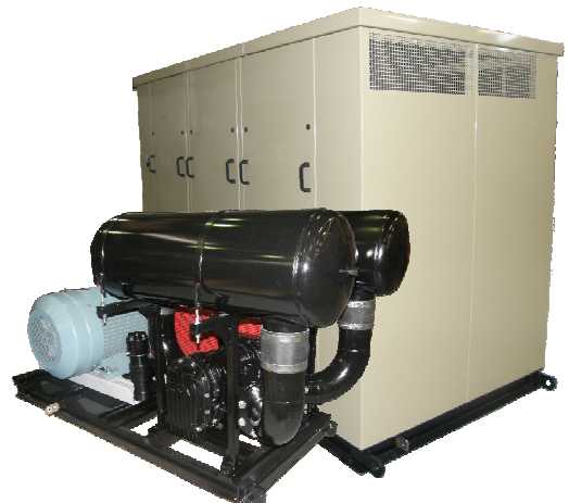
VP package for centralised vacuum in paper processing industry

The air injection ensures the self cooling of the blower without auxiliary fluid. It can run accidently with a closed inlet, without affecting your process.